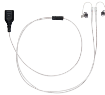
SnapLock 360 Dual-Ear (Item: RO-360-22-3.5SD)