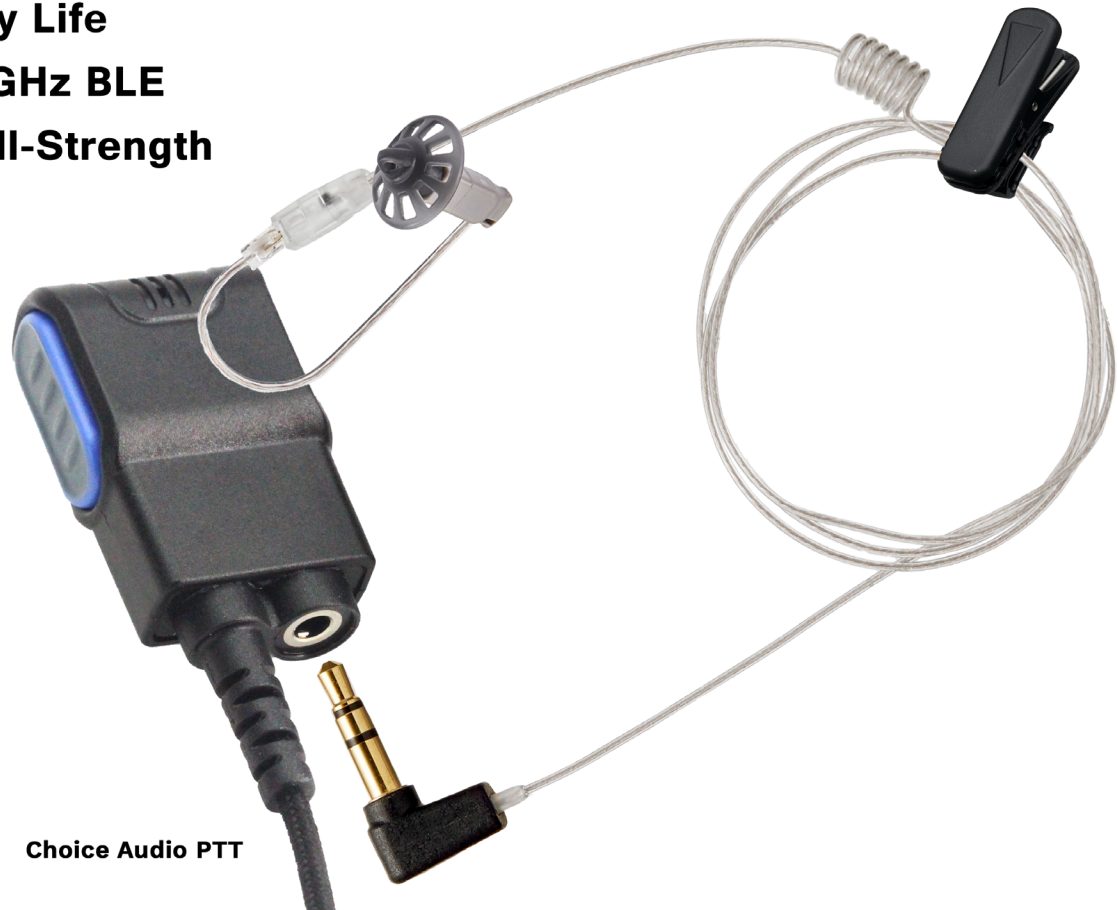
Choice Audio PTT