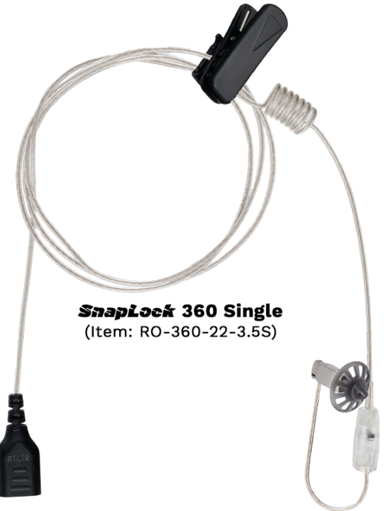
SnapLock 360 Single (Item: RO-360-22-3.5S)