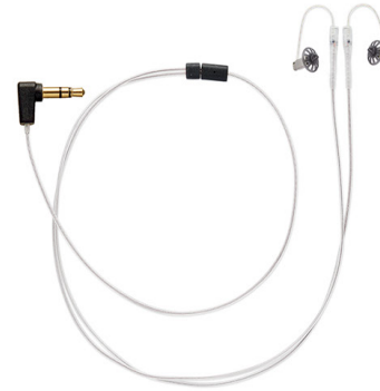
N-ear 360 3.5mm Single or Dual-Ear Item: N-RO-360